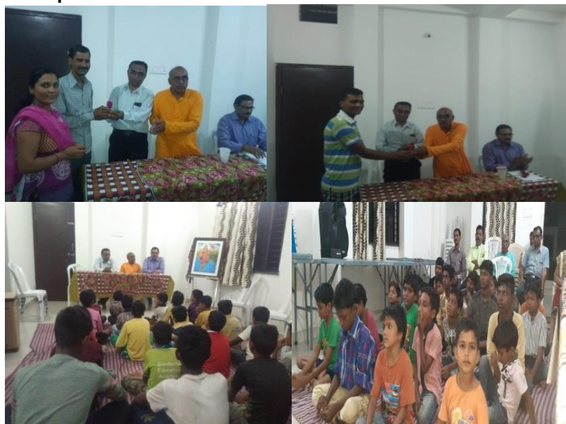
Table for study and meal donated by Purnabrahma Matrishakti Parivar, Nagpur